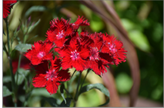
Rockin' Red Pinks flowers

Rockin' Red Pinks is recommended for the following landscape applications;