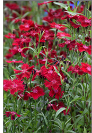
Rockin' Red Pinks flowers