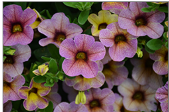
Chameleon Blueberry Scone Calibrachoa flowers