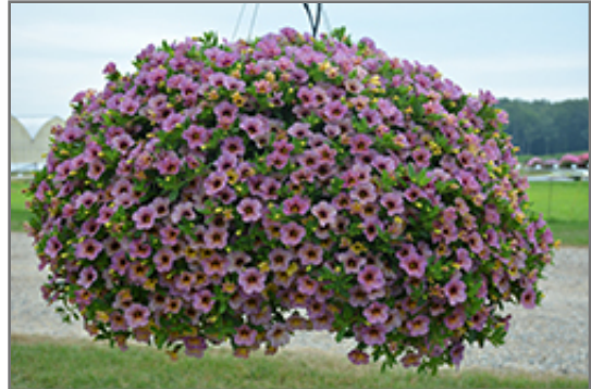
Chameleon Blueberry Scone Calibrachoa in bloom