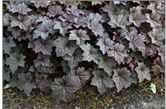
Palace Purple Coral Bells

Palace Purple Coral Bells will grow to be about 12 inches tall at maturity extending to 24 inches tall with the flowers, with a spread of 12 inches. When grown in masses or used as a bedding plant, individual plants should be spaced approximately 10 inches apart. Its foliage tends to remain dense right to the ground, not requiring facer plants in front. It grows at a medium rate, and under ideal conditions can be expected to live for approximately 10 years. As an evergreen perennial, this plant will typically keep its form and foliage year-round.