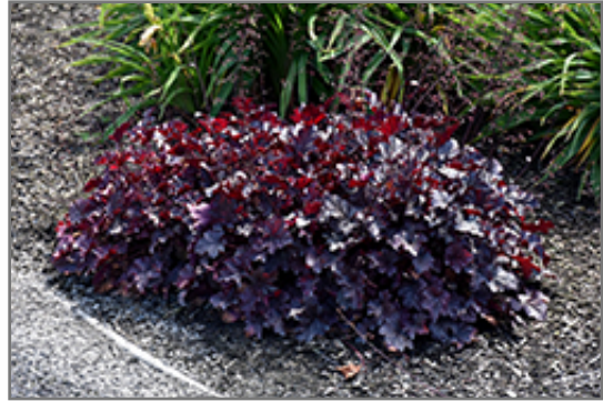
Plum Pudding Coral Bells

Plum Pudding Coral Bells will grow to be only 6 inches tall at maturity extending to 12 inches tall with the flowers, with a spread of 12 inches. When grown in masses or used as a bedding plant, individual plants should be spaced approximately 10 inches apart. Its foliage tends to remain low and dense right to the ground. It grows at a medium rate, and under ideal conditions can be expected to live for approximately 10 years. As an evergreen perennial, this plant will typically keep its form and foliage year-round.