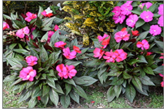
Infinity Blushing Lilac New Guinea Impatiens in bloom

Infinity Blushing Lilac New Guinea Impatiens will grow to be about 12 inches tall at maturity, with a spread of 12 inches. When grown in masses or used as a bedding plant, individual plants should be spaced approximately 8 inches apart. Its foliage tends to remain dense right to the ground, not requiring facer plants in front. This fast-growing annual will normally live for one full growing season, needing replacement the following year.