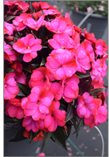
Infinity Blushing Lilac New Guinea Impatiens flowers