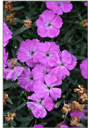
Paint The Town Fuchsia Pinks flowers

Paint The Town Fuchsia Pinks is recommended for the following landscape applications;