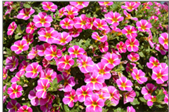
Superbells Rising Star Calibrachoa flowers