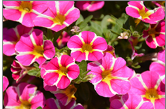
Superbells Rising Star Calibrachoa flowers

This plant will require occasional maintenance and upkeep. Trim off the flower heads after they fade and die to encourage more blooms late into the season. It is a good choice for attracting bees and hummingbirds to your yard, but is not particularly attractive to deer who tend to leave it alone in favor of tastier treats. It has no significant negative characteristics.