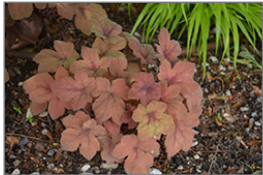
Pumpkin Spice Foamy Bells