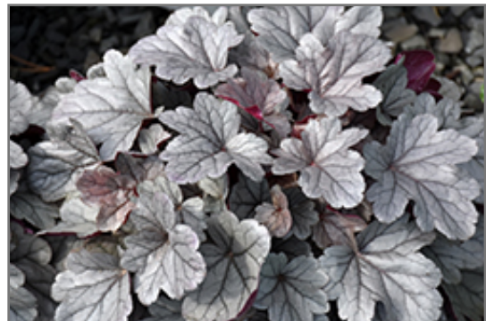
Dolce Silver Gumdrop Coral Bells