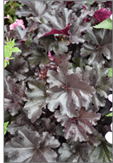
Black Pearl Coral Bells foliage

Black Pearl Coral Bells is recommended for the following landscape applications;