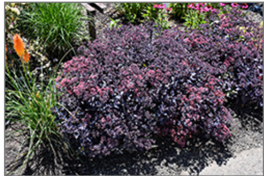
Cherry Truffle Stonecrop in bloom