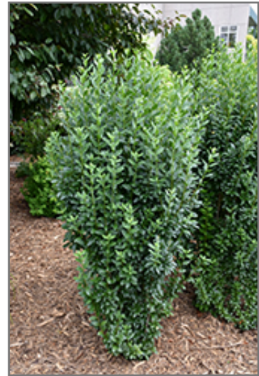
Straight Talk Privet