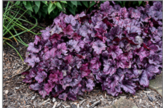
Wild Rose Coral Bells

Wild Rose Coral Bells is recommended for the following landscape applications;