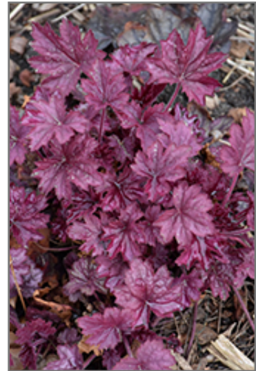
Wild Rose Coral Bells foliage