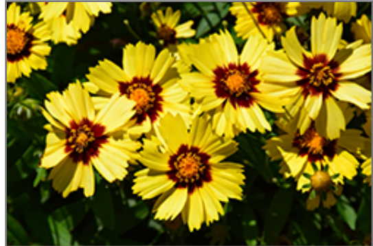
UpTick Yellow and Red Tickseed flowers

UpTick Yellow and Red Tickseed is recommended for the following landscape applications;