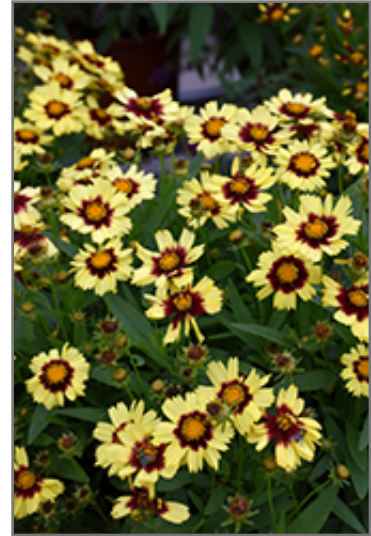
UpTick Yellow and Red Tickseed flowers

UpTick Yellow and Red Tickseed is a fine choice for the garden, but it is also a good selection for planting in outdoor pots and containers. It is often used as a 'filler' in the 'spiller-thriller-filler' container combination, providing a mass of flowers against which the thriller plants stand out. Note that when growing plants in outdoor containers and baskets, they may require more frequent waterings than they would in the yard or garden.