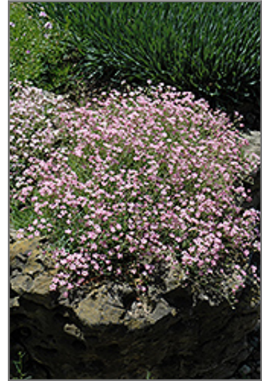
Pink Creeping Baby's Breath in bloom