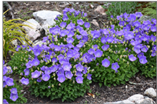
Rapido Blue Bellflower in bloom