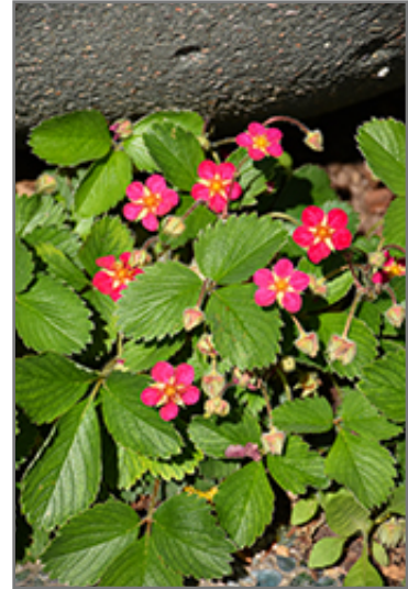
Lipstick Strawberry flowers

Lipstick Strawberry has masses of beautiful cherry red daisy flowers with yellow eyes along the stems from late spring to early summer, which are most effective when planted in groupings. Its tomentose round compound leaves remain green in color throughout the season. It features an abundance of magnificent red berries from mid spring to mid fall.