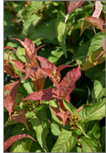
Kodiak Orange Diervilla foliage