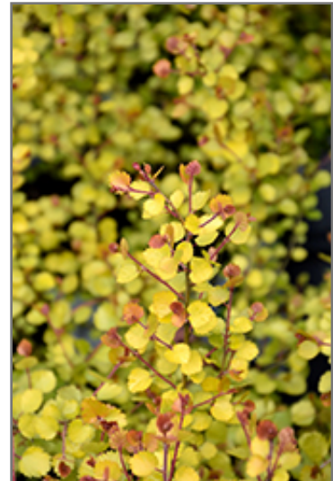
Cesky Gold Dwarf Birch foliage