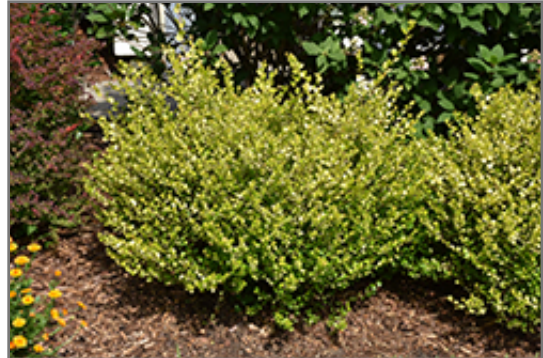
Cesky Gold Dwarf Birch