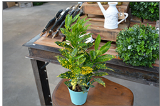
Gold Dust Variegated Croton