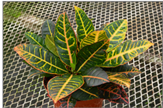
Petra Variegated Croton in full