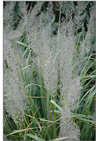
Korean Reed Grass fruit