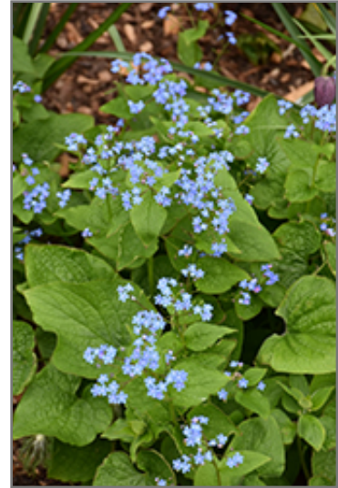
Siberian Bugloss flowers