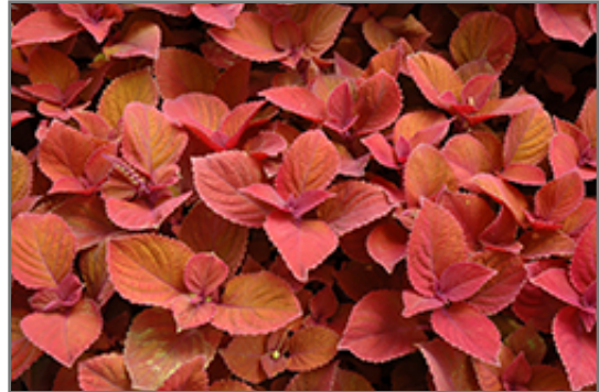
Campfire Coleus foliage