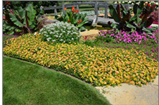
Supertunia Honey Petunia in bloom

Supertunia Honey Petunia is a fine choice for the garden, but it is also a good selection for planting in outdoor containers and hanging baskets. Because of its trailing habit of growth, it is ideally suited for use as a 'spiller' in the 'spiller-thriller-filler' container combination; plant it near the edges where it can spill gracefully over the pot. Note that when growing plants in outdoor containers and baskets, they may require more frequent waterings than they would in the yard or garden.