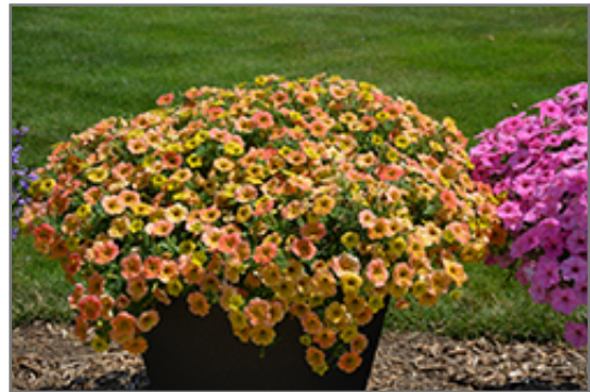
Supertunia Honey Petunia in bloom