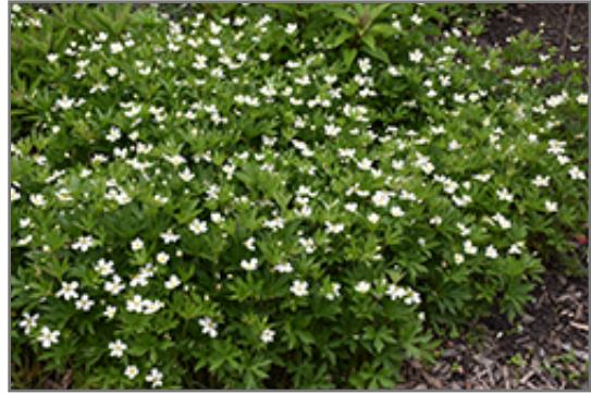
Windflower in bloom

This plant does best in full sun to partial shade. It prefers to grow in average to moist conditions, and shouldn't be allowed to dry out. It is not particular as to soil type or pH. It is somewhat tolerant of urban pollution. This species is not originally from North America. It can be propagated by division.