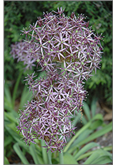
Star Of Persia Onion flowers