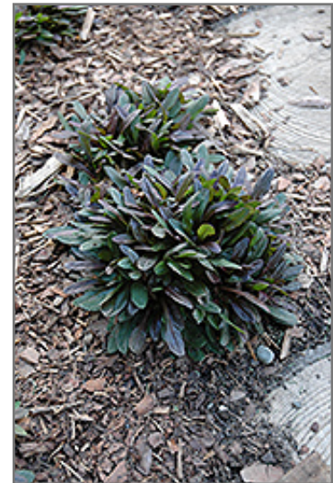
Chocolate Chip Bugleweed