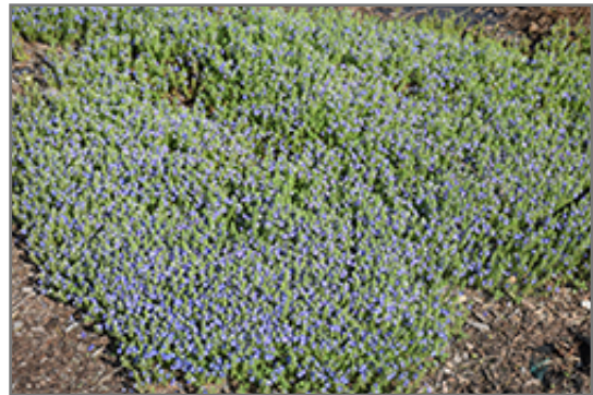
Tidal Pool Speedwell in bloom