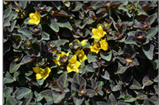
Midnight Sun Moneywort flowers

Midnight Sun Moneywort is recommended for the following landscape applications;