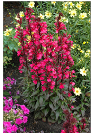
Starship Deep Rose Lobelia in bloom