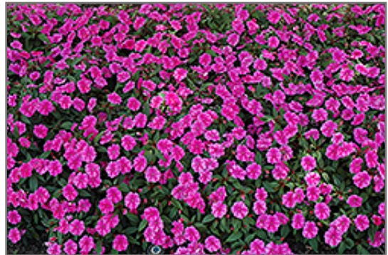
Bounce Pink Flame Impatiens in bloom