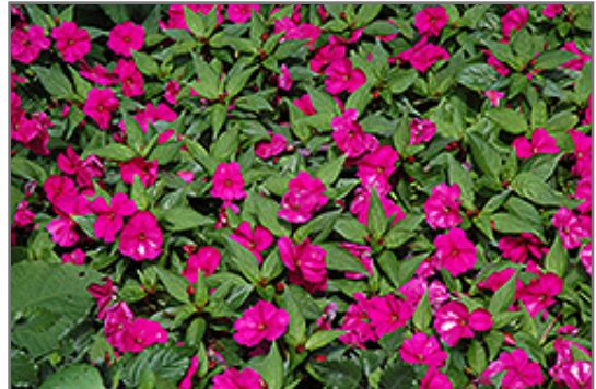
Big Bounce Violet Impatiens in bloom