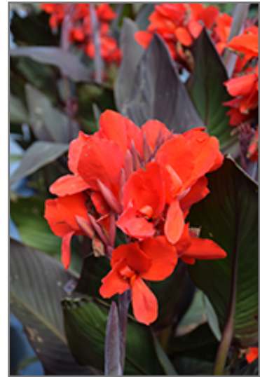
Cannova Bronze Scarlet Canna flowers

This plant is native to the tropics and prefers growing in moist environments with evenly warm conditions all year round. In our climate, it is usually grown as an outdoor annual in the garden or in a container. If you want it to survive the winter, it can be brought in to the house and provided with special care, and then returned to the garden the following season. In its preferred tropical habitat, it can grow to be around 4 feet tall at maturity, with a spread of 20 inches. However, when grown as an annual or when overwintered indoors, it can be expected to perform differently, and its exact height and spread will depend on many factors; you may wish to consult with our experts as to how it might perform in your specific application and growing conditions.