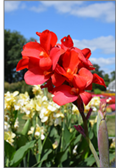
Cannova Bronze Scarlet Canna flowers

Cannova Bronze Scarlet Canna is a fine choice for the garden, but it is also a good selection for planting in outdoor pots and containers. With its upright habit of growth, it is best suited for use as a 'thriller' in the 'spiller-thriller-filler' container combination; plant it near the center of the pot, surrounded by smaller plants and those that spill over the edges. It is even sizeable enough that it can be grown alone in a suitable container. Note that when growing plants in outdoor containers and baskets, they may require more frequent waterings than they would in the yard or garden. Be aware that in our climate, this plant may be too tender to survive the winter if left outdoors in a container. Contact our experts for more information on how to protect it over the winter months.