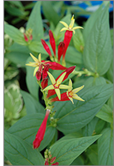
Indian Pink flowers