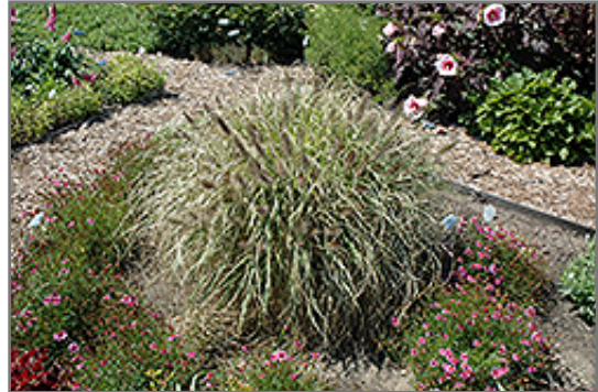
Ginger Love Fountain Grass