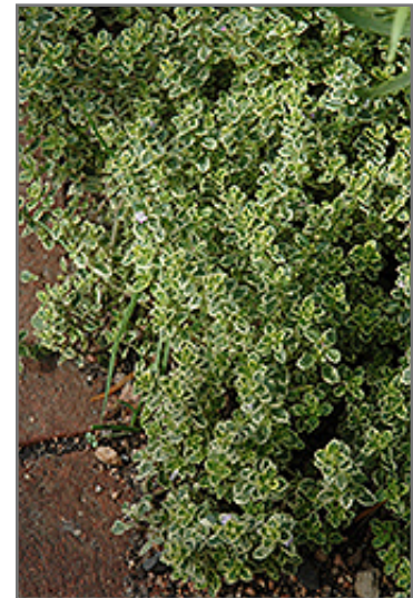
Aureus Lemon Thyme foliage