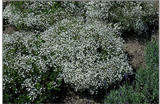
Summer Sparkles Baby's Breath in bloom

This plant should only be grown in full sunlight. It prefers dry to average moisture levels with very well-drained soil, and will often die in standing water. It is considered to be drought-tolerant, and thus makes an ideal choice for a low-water garden or xeriscape application. It is not particular as to soil type, but has a definite preference for alkaline soils, and is able to handle environmental salt. It is highly tolerant of urban pollution and will even thrive in inner city environments. This is a selected variety of a species not originally from North America.