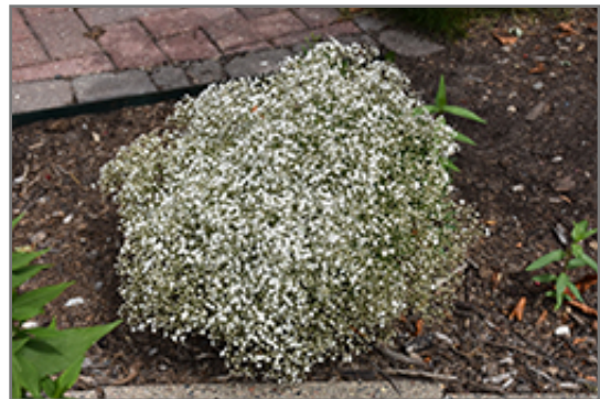
Summer Sparkles Baby's Breath in bloom