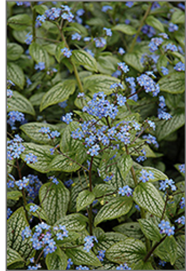
Silver Heart Bugloss flowers