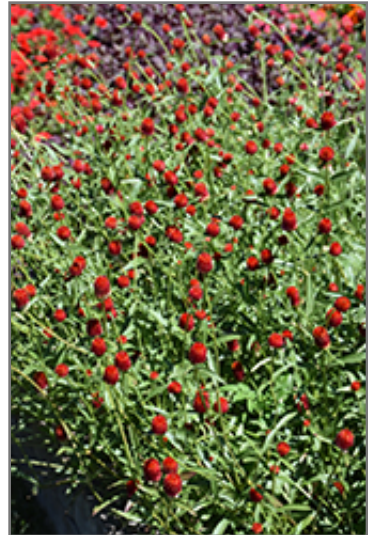
Qis Red Gomphrena flowers