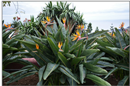
Orange Bird Of Paradise in bloom