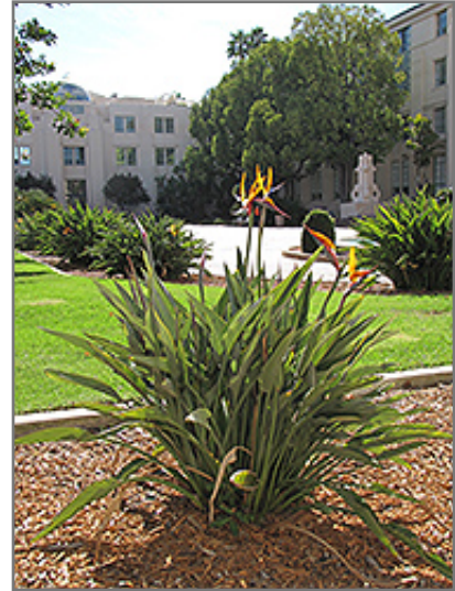
Orange Bird Of Paradise in bloom

Orange Bird Of Paradise is a fine choice for the garden, but it is also a good selection for planting in outdoor pots and containers. With its upright habit of growth, it is best suited for use as a 'thriller' in the 'spiller-thriller-filler' container combination; plant it near the center of the pot, surrounded by smaller plants and those that spill over the edges. It is even sizeable enough that it can be grown alone in a suitable container. Note that when growing plants in outdoor containers and baskets, they may require more frequent waterings than they would in the yard or garden. Be aware that in our climate, this plant may be too tender to survive the winter if left outdoors in a container. Contact our experts for more information on how to protect it over the winter months.