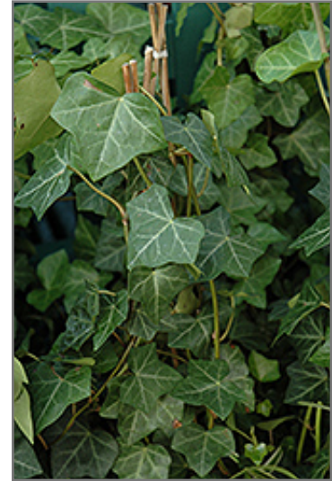
Thorndale Ivy foliage