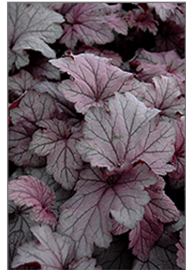
Spellbound Coral Bells foliage