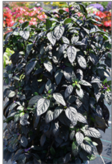
Black Pearl Ornamental Pepper