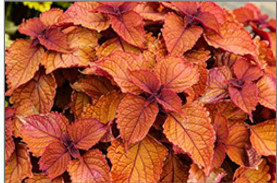
Wall Street Coleus foliage