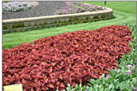
Wall Street Coleus