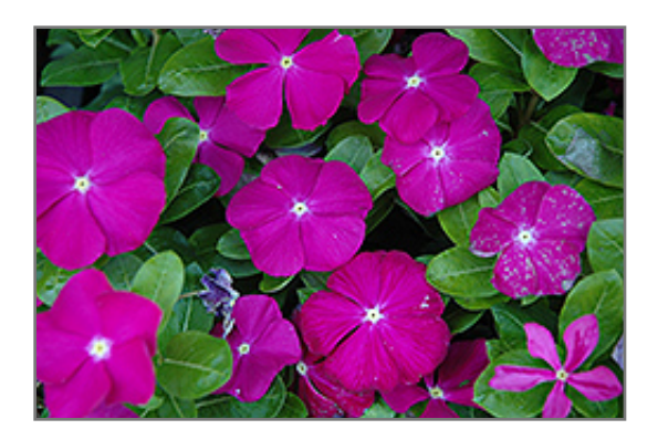
Sunstorm Deep Orchid Vinca flowers