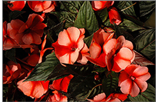
Harmony Salmon Cream New Guinea Impatiens flowers

Harmony Salmon Cream New Guinea Impatiens is recommended for the following landscape applications;