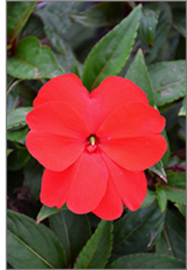
Florific Red New Guinea Impatiens flowers