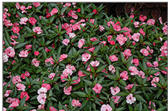
SunPatiens Spreading Pink Flash New Guinea Impatiens in bloom