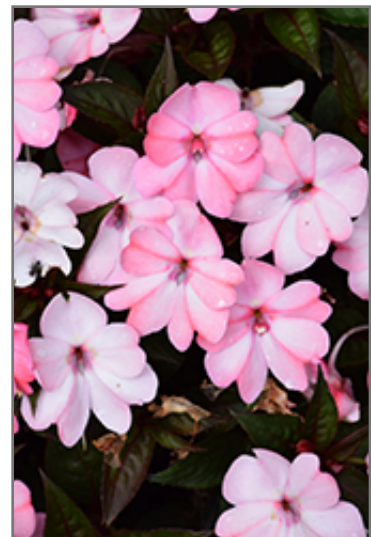
SunPatiens Compact Blush Pink New Guinea Impatiens flowers