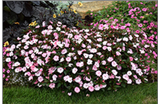
SunPatiens Compact Blush Pink New Guinea Impatiens in bloom

SunPatiens Compact Blush Pink New Guinea Impatiens is recommended for the following landscape applications;